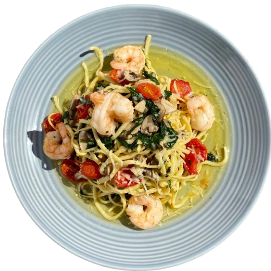
Coastal Shrimp Linguine

Chicken, broccoli, peas, alfredo and tagliatelle pasta